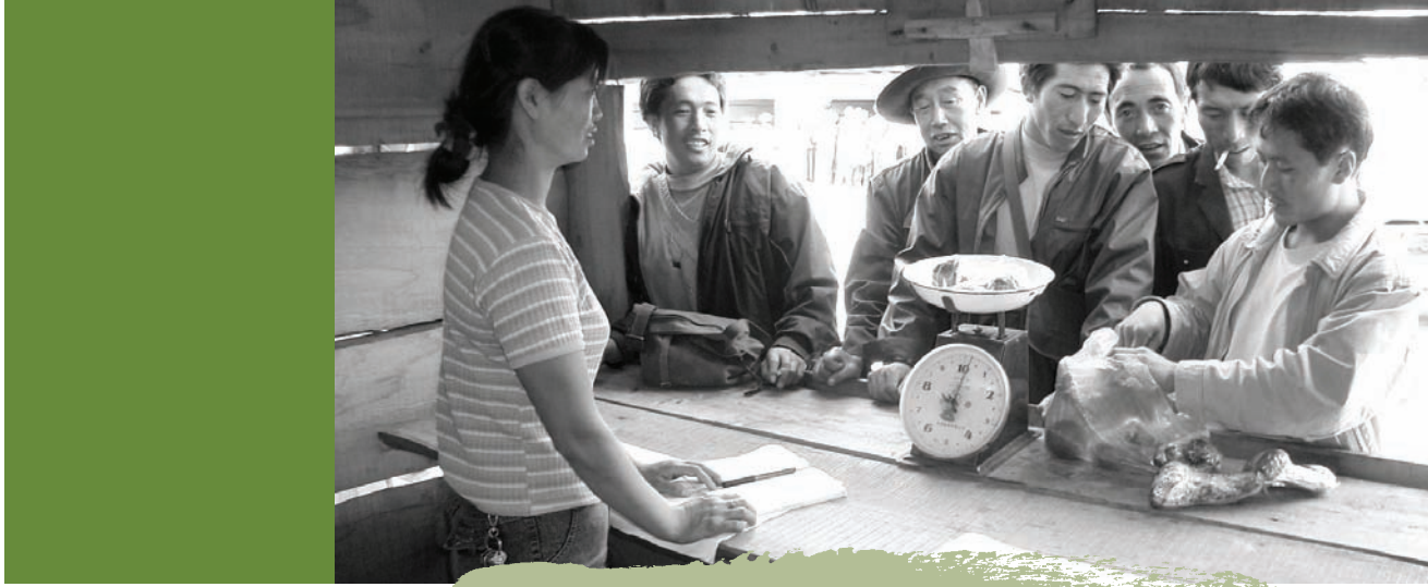
JIEDI – Matsutake buyers and sellers at the official village matsutake market waiting for the signal to begin trading