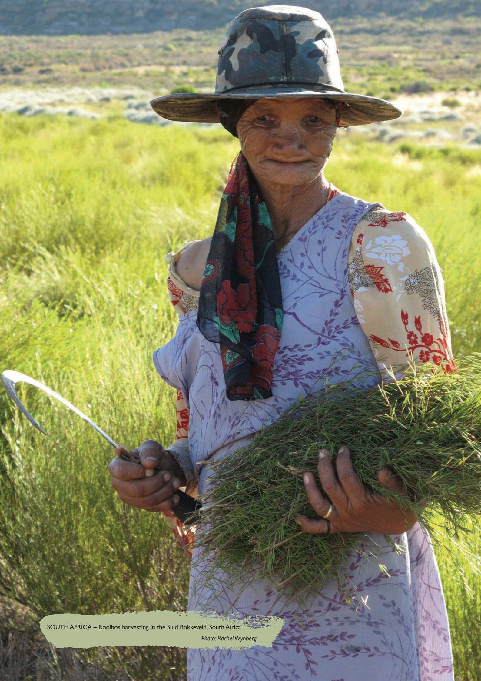
SOUTH AFRICA – Rooibos harvesting in the Suid Bokkeveld, South Africa