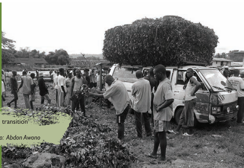
CAMEROON – Eru ( Gnetum spp.) loaded onto taxi in transition from Cameroon to Nigeria